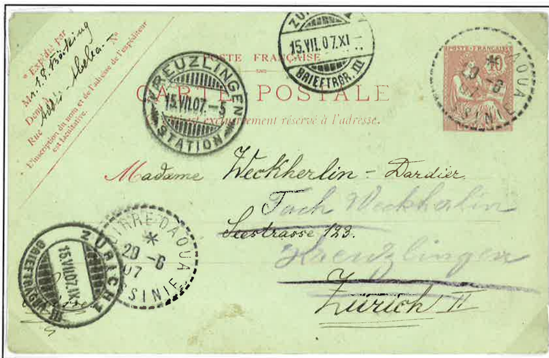
ONE OF TWO RECORDED LEVANT POSTAL CARDS USED IN ETHIOPIA