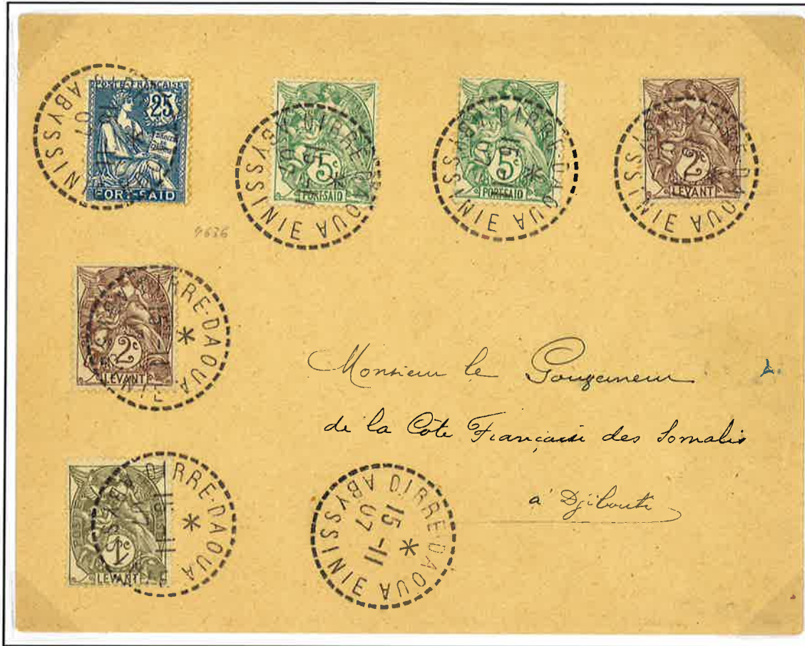
November 11, 1907 Dire Daoua to Djibouti Philatelic cover with philatelic franking.

It is unclear which values of Levant and Port-Said stamps were sent to Ethiopia. The 5, 10, 25, and 50 centimes were used regularly, but lower and higher values were supplied although not recorded used except on philatelic covers. Levant postal cards at 10 centimes were supplied but saw very little use.